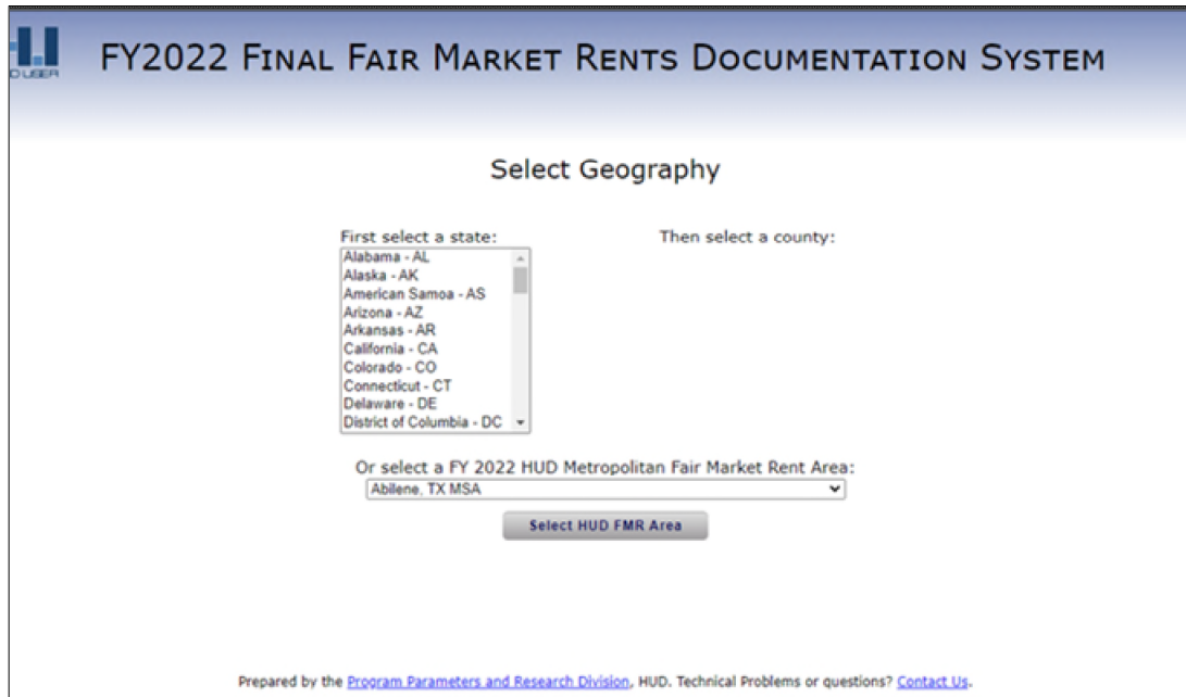
Figure 2: Screenshot of FMR Documentation System