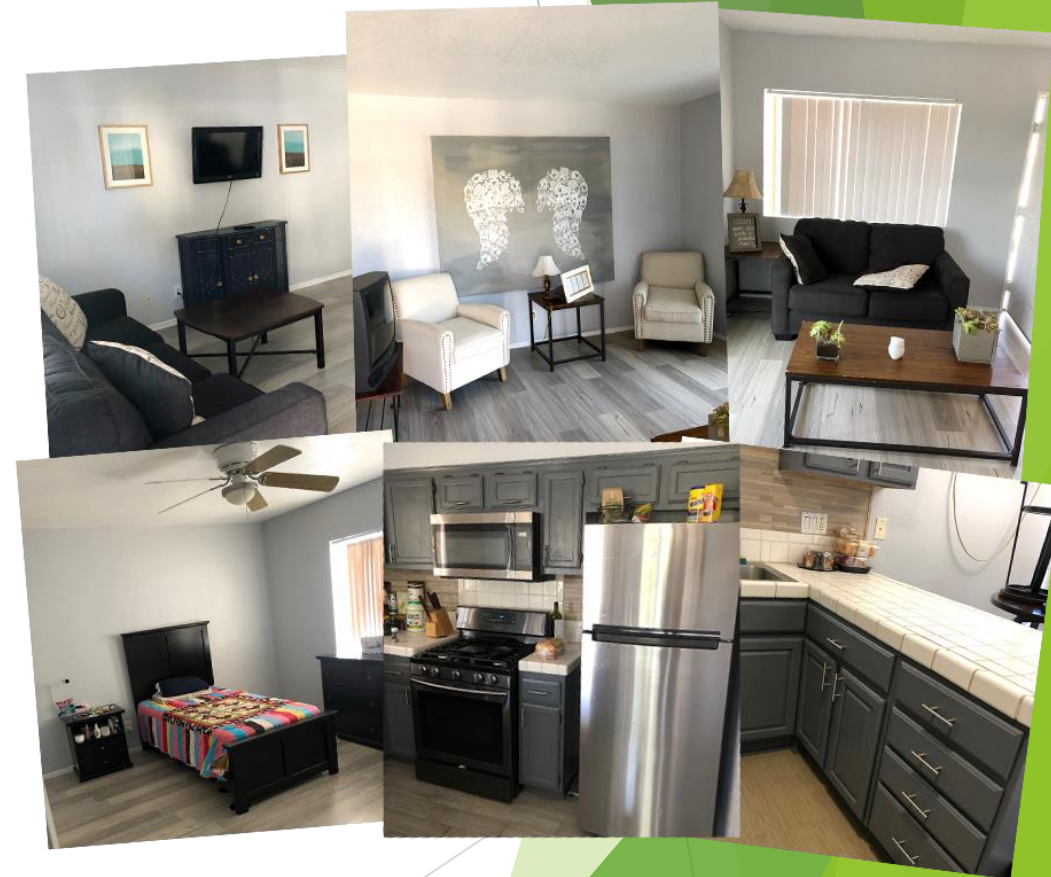
MAIN STREET TRANSITIONAL LIVING PROGRAM APARTMENTS

4509 Main Street, Riverside, CA 92501 951-369-4921